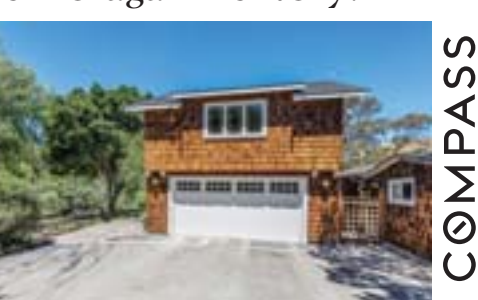
1065 Bollinger Canyon, Moraga 3+ BD | 2BA | 2,746 sq.ft | 2.33 acres Offered at $1,550,000 Private Showings by Appointment Only